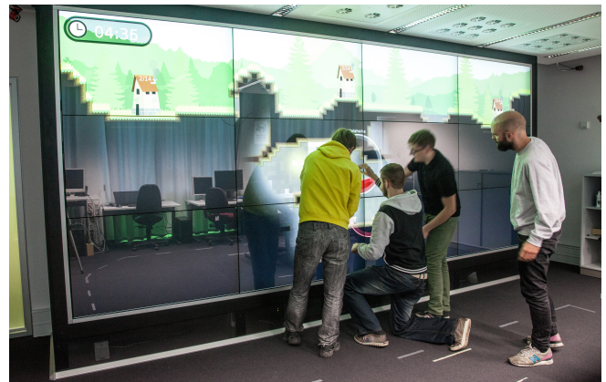
Figure 1. Typical Miners gameplay scene

As display technology advances, wall-sized interactive displays will become usable in more and more settings. Current high-resolution displays often support input modalities such as touch, pen and marker-based tangible input. Research in this area has focused mostly on professional use, e.g., for visualization [1]. Work on wall interaction has found them well-suited for collaboration [13], with physical navigation – locomotion