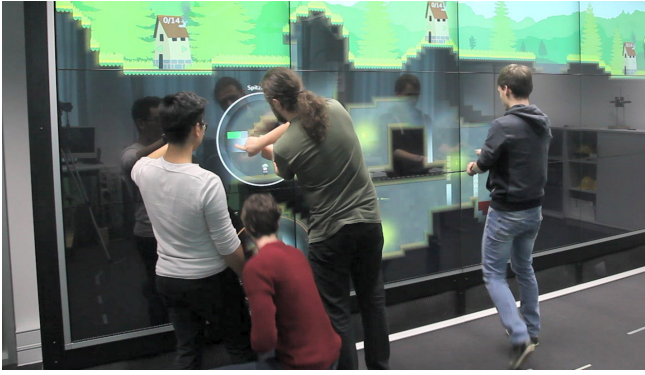
Figure 4. Awareness issues: The player at the right cannot see what the other players are doing.