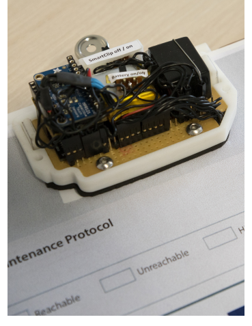
Figure 2. IllumiPaper Smart Clip: The paper clip provides eight EL displays, four resistive and twelve capacitive touch channels.