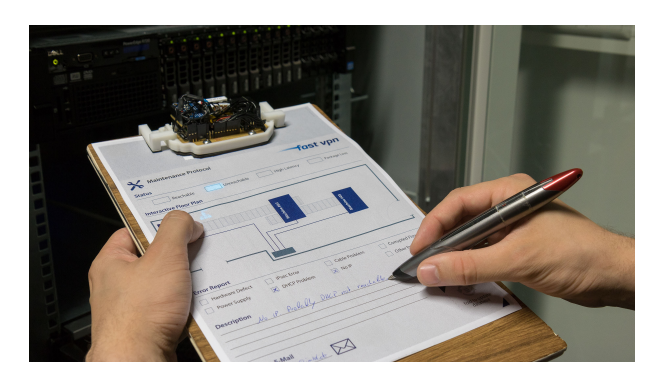
Figure 1. Maintenance Form Filling Application: Our smart form system supports maintenance workers to create error reports faster by providing real-time status information for network machines on the paper itself using novel printed electronics.